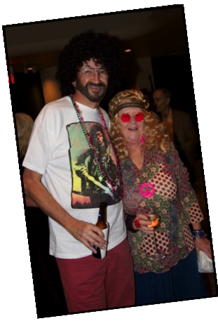
The costumes for the October 2012 Ball were quite amazing. We wanted to share a few more with you.

Here are a few photos to share some of the fun-filled lighter side of volunteering. Photos include the “Mask”querade Party as well as our honor of being asked to lead the Carefree Christmas Parade.