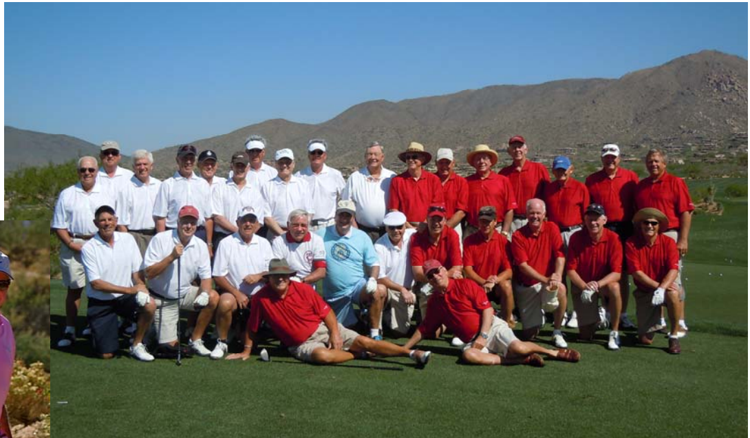
Hutton Golf Group

The Hutton Golf group has quietly contributed to meet many community needs. It is nice to know these caring supporters are always there to help others.