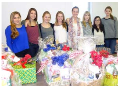
Cactus Shadows High School S Club Holiday Gift Wrapping

"I want to thank you all for such a generous Christmas gift! It was such a wonderful surprise. More importantly, thank you so very much for helping me and driving me to all my doctor appointments."