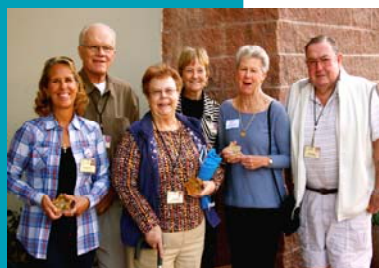
Volunteers with FCC 10+ years who attended received a Gold Award