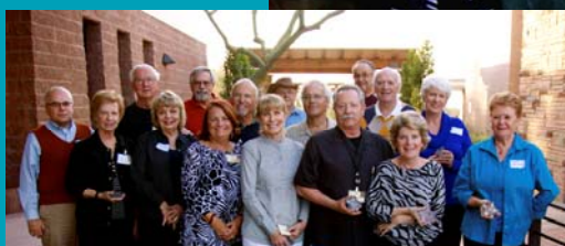
Volunteers with FCC 5+ years who attended received a Silver Award

What a wonderful group of volunteers! Thank you for your 40,000+ hours of service!