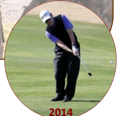
2014 Hole-in-One Winner

Title Sponsor: $25,000 (includes 16 players) Gold Sponsor: $15,000 (includes 12 players) Silver Sponsor: $10,000 (includes 8 players) Bronze Sponsor: $ 5,000 (includes 4 players) Hole Sponsor: $ 1,500 (includes 2 players) Individual Player: $ 350