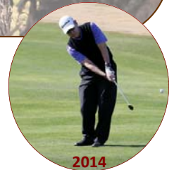
2014 Hole-in-One Winner

Title Sponsor: $25,000 (includes 16 players) Gold Sponsor: $15,000 (includes 12 players) Silver Sponsor: $10,000 (includes 8 players) Bronze Sponsor: $ 5,000 (includes 4 players) Hole Sponsor: $ 1,500 (includes 2 players) Individual Player: $ 350