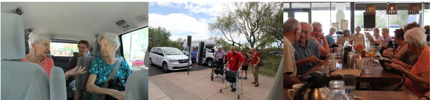
First Watch Brunch Van Outing ~ July 18, 2016