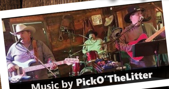
Music by PickO'TheLitter