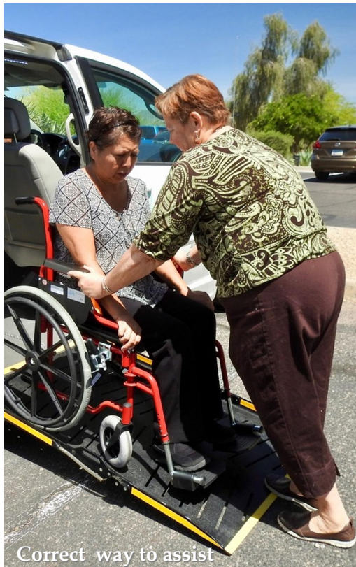
Correct way to assist

Here is a photograph that reflects the correct practices as currently recommended by PASS. The first shows the person in the wheelchair going down the ramp facing away (backwards) from the direction of travel. The 'pusher' has control of the wheelchair using both hands on the wheelchair's handgrips. Under ADA regulations, a person in a wheelchair has a choice of directions to face when accessing or exiting a vehicle. Should the person in the wheelchair elect to face forward (direction of travel), the 'pusher' would be positioned on the downside facing the vehicle with both hands on the arms of the wheelchair.