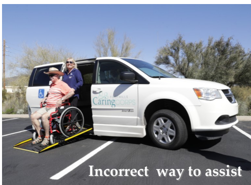
Incorrect way to assist