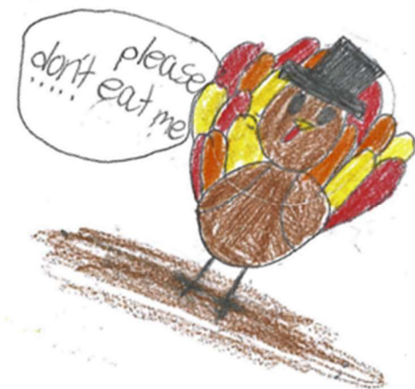
A selection of Thanksgiving cards to Caring Corps Neighbors from Fireside Elementary 6 th Graders